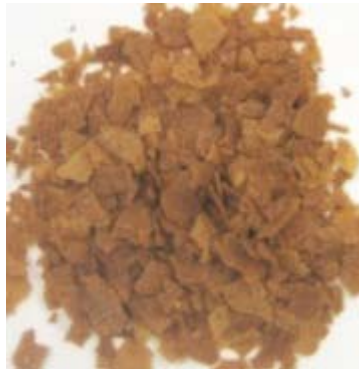
04511- Paillete Feuilletine 1/5.5lb Barry Callebaut Level 2 $27.86/cs $5.07/lb