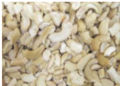
00208- Cashew, Small Pieces No.1 Brazil 25lb Level 2 $67.50/cs $2.70/lb Also Available U0208- Cashew, Small Pieces No 1 Brazil 50lb Level 2 $130.00/cs $2.60/lb