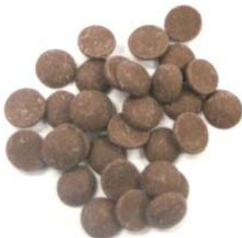
04507- 823 Milk Chocolate Coverture 1/11lb Barry Callebaut Level 2 $46.87/cs $4.26/lb