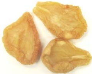
00896- Pear, CA Fancy 25LB Level 2 $83.75/cs $3.35/lb