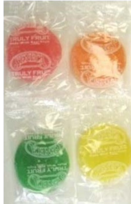
06306- Orchard Fruit Gems 6/5lb Level 2 $84.00/cs $2.80/lb