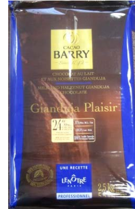
04512- Gianduja Milk Chocolate 1/11lb Barry Callebaut Level 2 $63.82/cs $5.80/lb